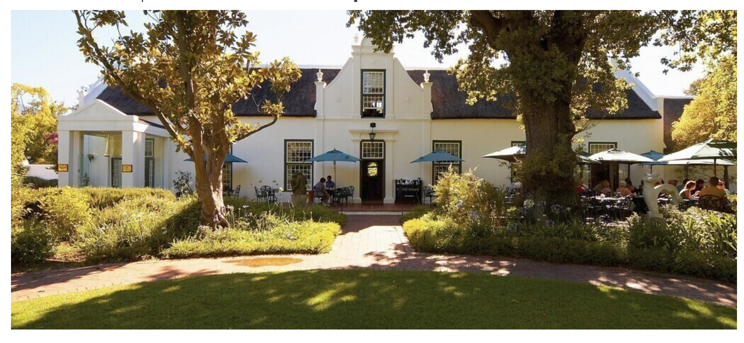
November 6 - 8 | Erinvale Estate Hotel & Spa

Thoughtfully selected for its prime position, Ernie Els winery is framed by panoramic views of Cape Town and Table Mountain to the west, and Stellenbosch and the Helderberg mountains to the east. A passage beyond our grand granite boulders, and through our wooden farmhouse-style doors will lead you into our homely, expansive tasting room and restaurant where you will be rewarded with exceptional wines and hearty farm-style cuisine.